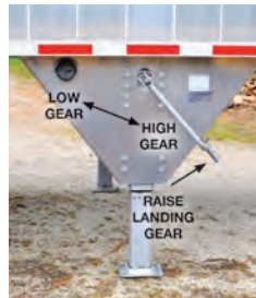
Figure 2: Landing Gear Operation